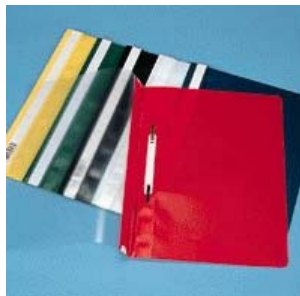
Clear view folder