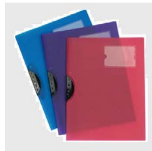
Swing clip file